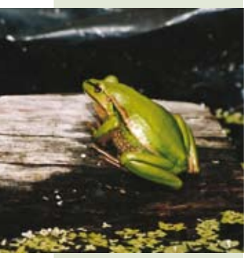
Green and golden bell frogs love to bask on logs