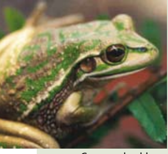
Green and golden bell frog