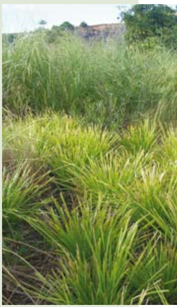
Frog-friendly vegetation at Sydney Olympic Park