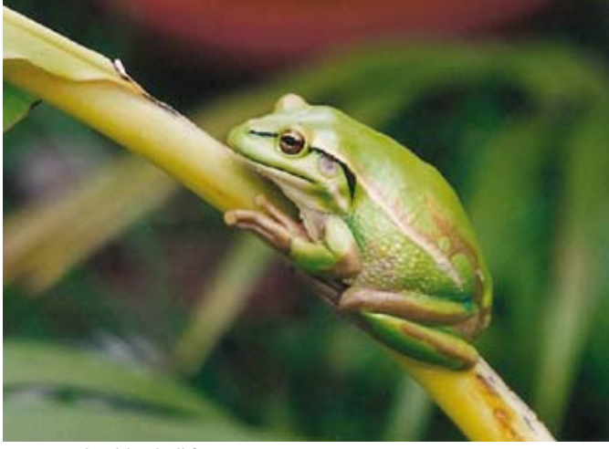
Green and golden bell frog