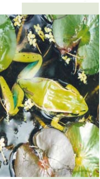
The green and golden bell frog has an electric blue splash on the groin and back of the thighs

You can obtain other threatened species brochures at www.environment.nsw.gov.au/threatenedspecies or contact the Environment Line on 131 555.