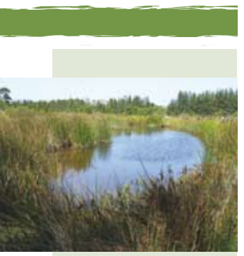
Green and golden bell frog pond at Sydney Olympic Park