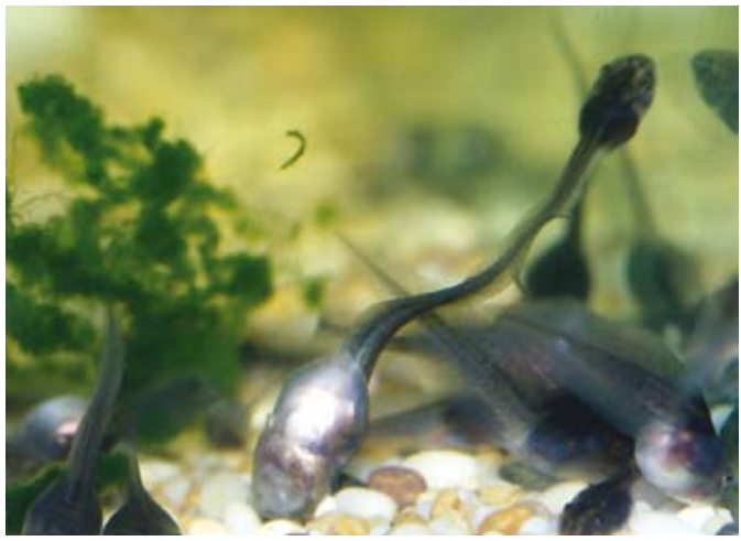
Green and golden bell frog tadpoles