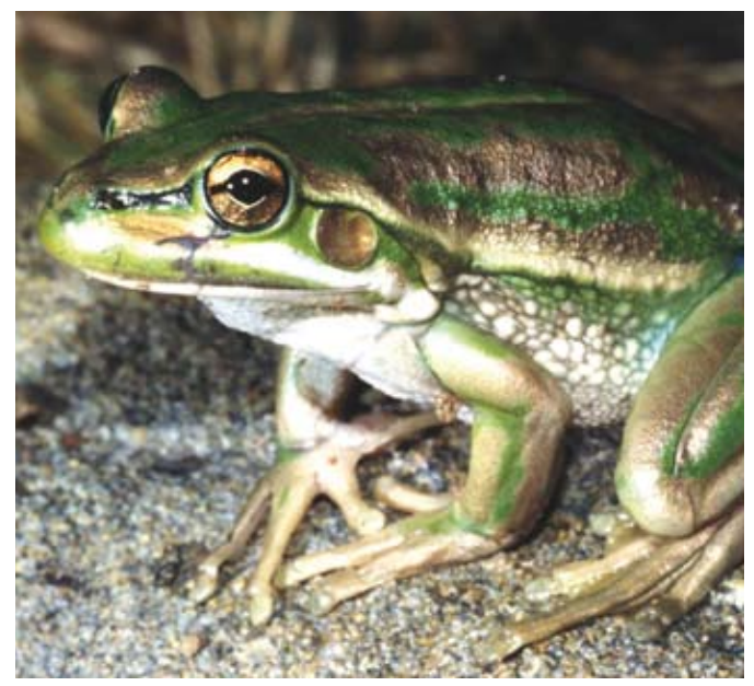
Green and golden bell frog