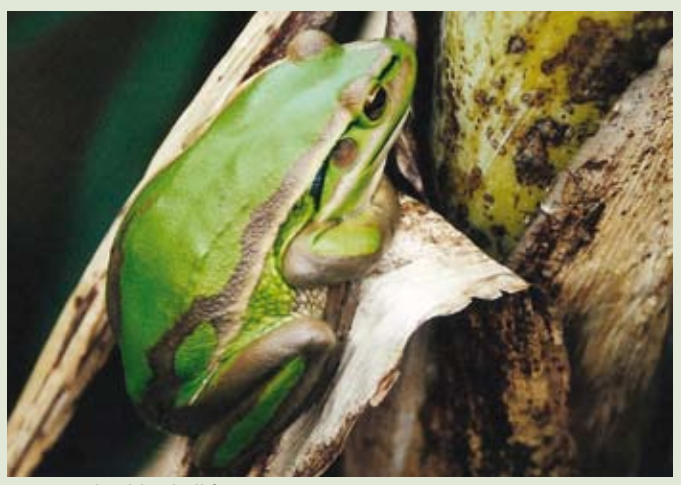
Green and golden bell frog

The frog is now found at the Brickpit, Narawang Wetland, Kronos Hill and Wentworth Common, and can also be seen in other parts of the park and the surrounding community.