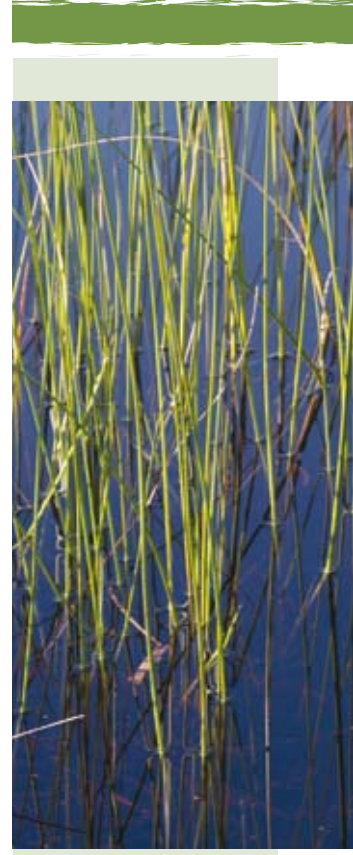
Emergent aquatic plants