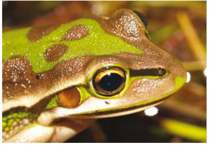
Green and golden bell frog

This brochure also lets you know about the valuable work that is occurring in Sydney Olympic Park to conserve and enhance green and golden bell frog habitat.