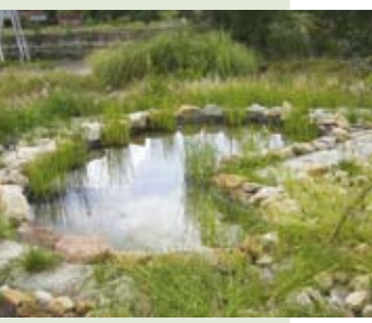
Constructed frog pond at Sydney Olympic Park

Six kilometres of frog fencing have been installed to guide frogs through underpasses and prevent them from hopping onto the roads in the park.