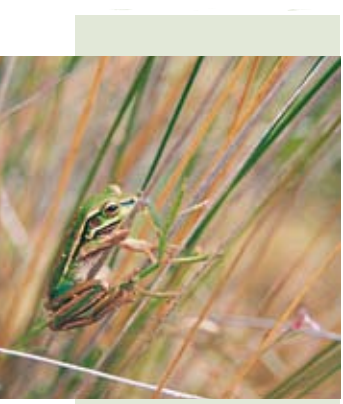
Juvenile green and golden bell frog