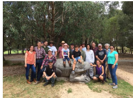
Figure 9. One of several inclusive and friendly AHS reptile survey teams (2016) with Wentworth Common's sedentary frog.

In summary, there is arguably much more work that can be done to obtain a more complete picture of the abundance and short and long-term spatiotemporal distribution of the various reptile populations within the boundaries of the Park, although some of the larger frogs are remarkably sedentary (Figure 9). Continued collaboration between AHS and SOPA will contribute to a better understanding of reptile fauna in the Park, and how to manage habitat to conserve them.