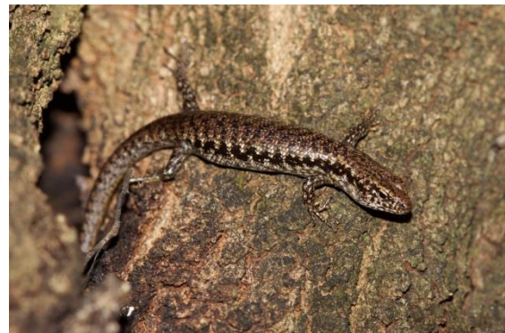
Figure 5. Eastern Water Skink (a) and Bar-sided Skink (b) in Sydney Olympic Park

Also common are the iconic and distinctive Eastern Blue-tongued Lizard ( Tiliqua scincoides ) and the far less conspicuous Grass Sun-Skink or Pale-flecked Garden Sunskink ( Lampropholis guichenoti ). The latter species can look quite similar to its dark-flecked relative, in particular when it dashes off and disappears in the undergrowth, but usually has a more or less conspicuous dark vertebral stripe and may look more greyish. The Eastern Blue-tongued Lizard