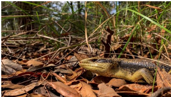
Figure 6. One of many Eastern Blue-tongued Lizards in Sydney Olympic Park

is a well-known large-sized and slow-moving skink with a large triangular head, often with beautiful patterns on the back (Figure 6). For one reason or another, they tend to lose many of their toes when they grow older, but that is admittedly somewhat harder to see without closer inspection.