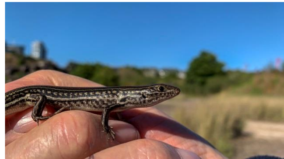
Figure 7. A Robust Ctenotus found in the Brickpit

observed during the years 2015–2019. As indicated by its name, this active diurnal lizard has a conspicuous reddish tail.