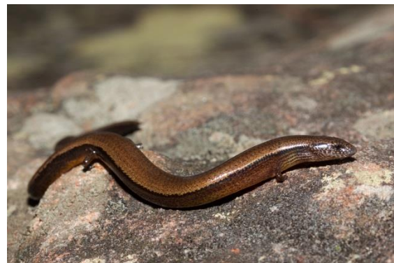
Figure 8. Weasel Skink (a) and Three-toed Skink (b)

Another dragon that is known to occur in Sydney Olympic Park is the Bearded Dragon ( Pogona barbata ). There is however only one record in the SOPA database in the last few years, and this is an incidental observation from October 2018, with previous records from 2013 and 2010. Although this is also a rather large dragon, it is much more cryptic than the previous species, usually seen on fence post or tree trunks. Perhaps a more systematic search that is focused on this species would be useful, although it is secure in NSW. In any case, these dragons appear to be rare in the Park.