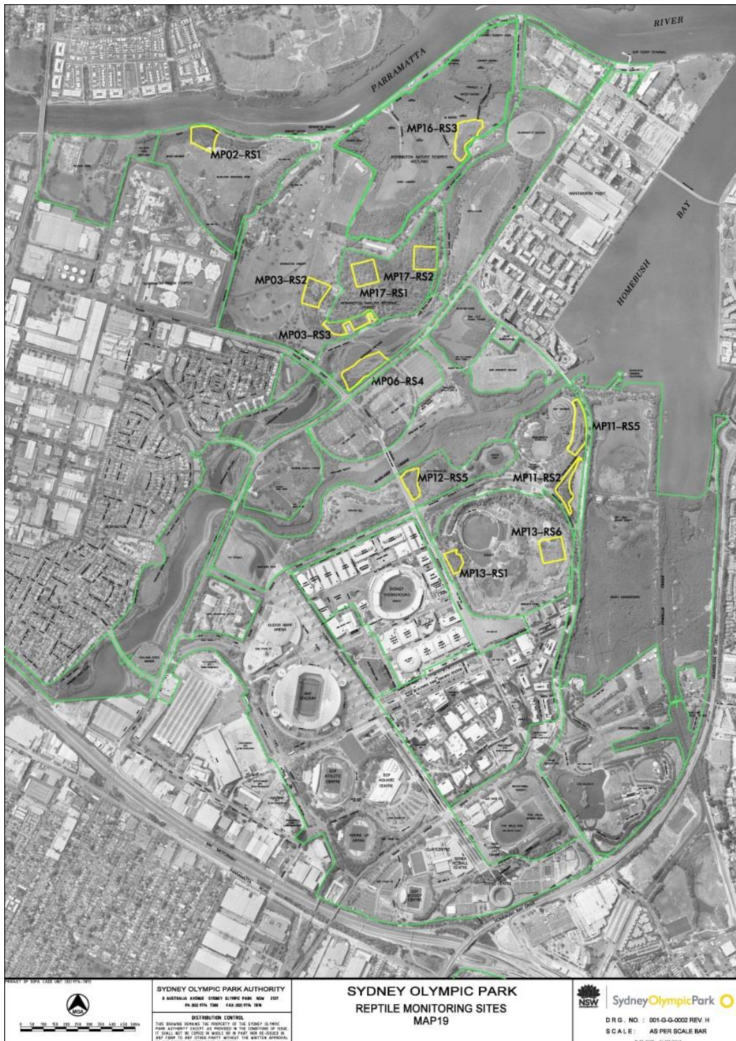
Figure 1. Reptile survey plots at Sydney Olympic Park (yellow). Green lines denote precinct boundaries of the Park.