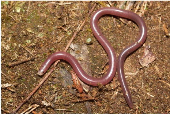
Figure 4. A Blackish Blind Snake from Macquarie Park, Sydney

The two most observed species are the (Dark-flecked) Garden Sunskink ( Lampropholis delicata ) and the Eastern Water Skink ( Eulamprus quoyii ); in fact, they are so common that they are almost certainly under-reported. Both species can tolerate considerable urban development, and many people are familiar with them. As indicated by its English name, the Eastern Water Skink is often (but not always) living in the vicinity of aquatic bodies of some sort, and is usually quite conspicuous where it occurs. It is a fairly large sized active brownish lizard with two more or less distinctive golden-coloured stripes on the back, and darker flanks with many small light spots (Figure 5a). The Garden Sunskink on the other hand is a small brown, more uniformly coloured and perhaps less conspicuous skink, which is abundant throughout the Park.